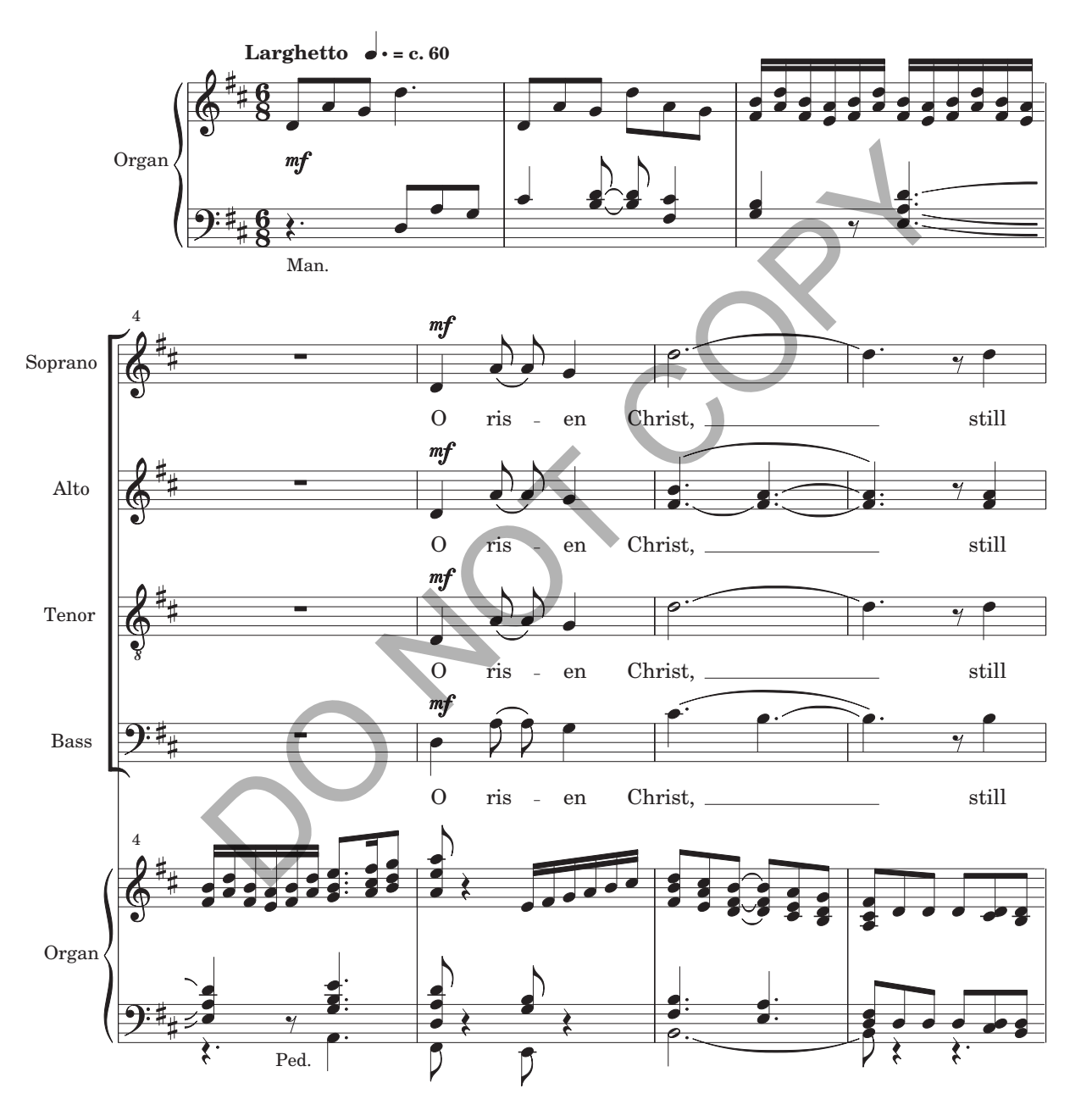
Words: © 1990 Hope Publishing Company, Carol Stream, IL 60188 All rights reserved. Used by permission.

Music: Copyright © 2016 by Paraclete Press, Orleans, MA 02653 All rights reserved.