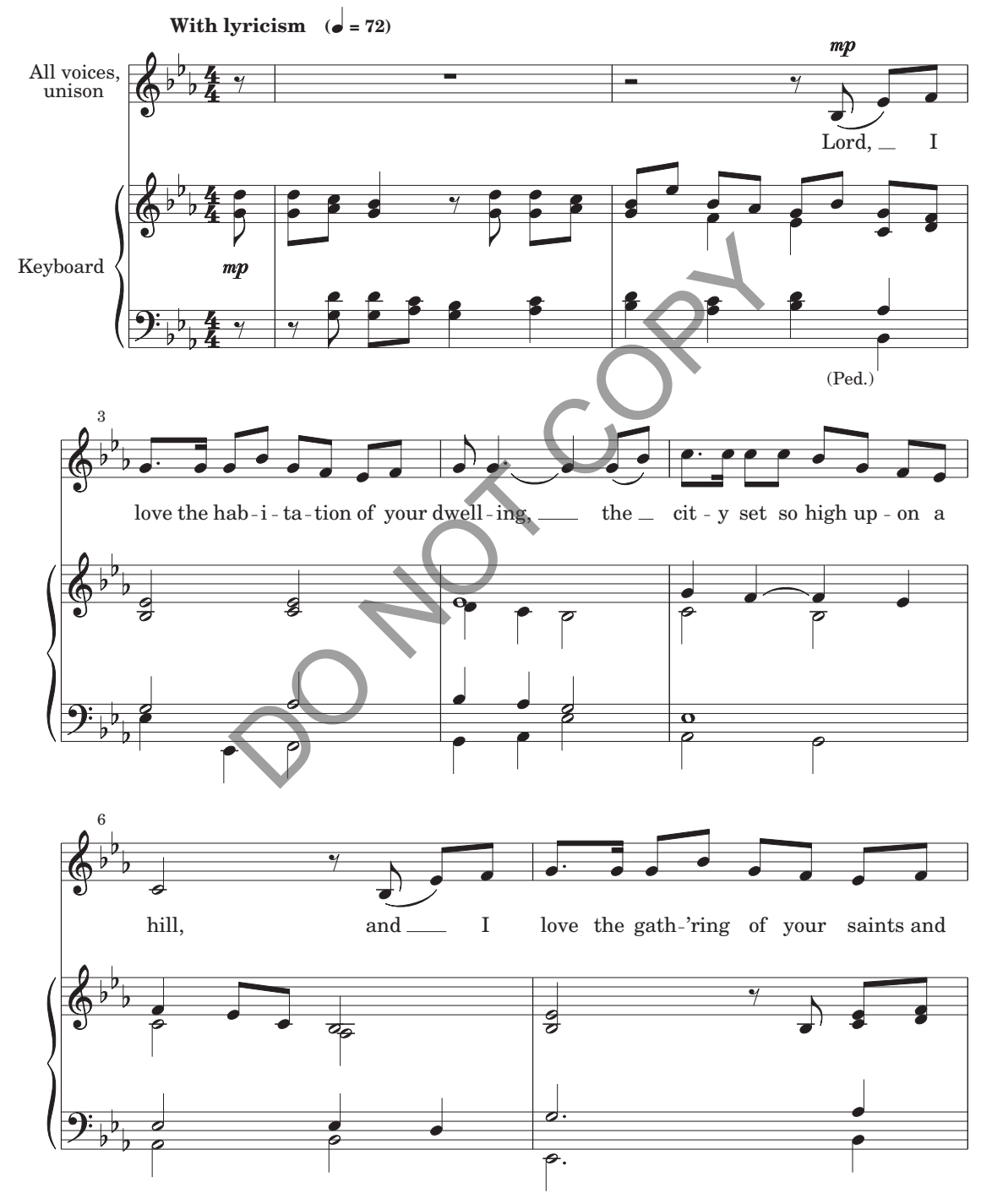
\begin{array}{c} \mbox{Copyright} @ 2011 \mbox{ by Paraclete Press, Orleans, MA 02653} \\ \mbox{ All rights reserved.} \end{array}