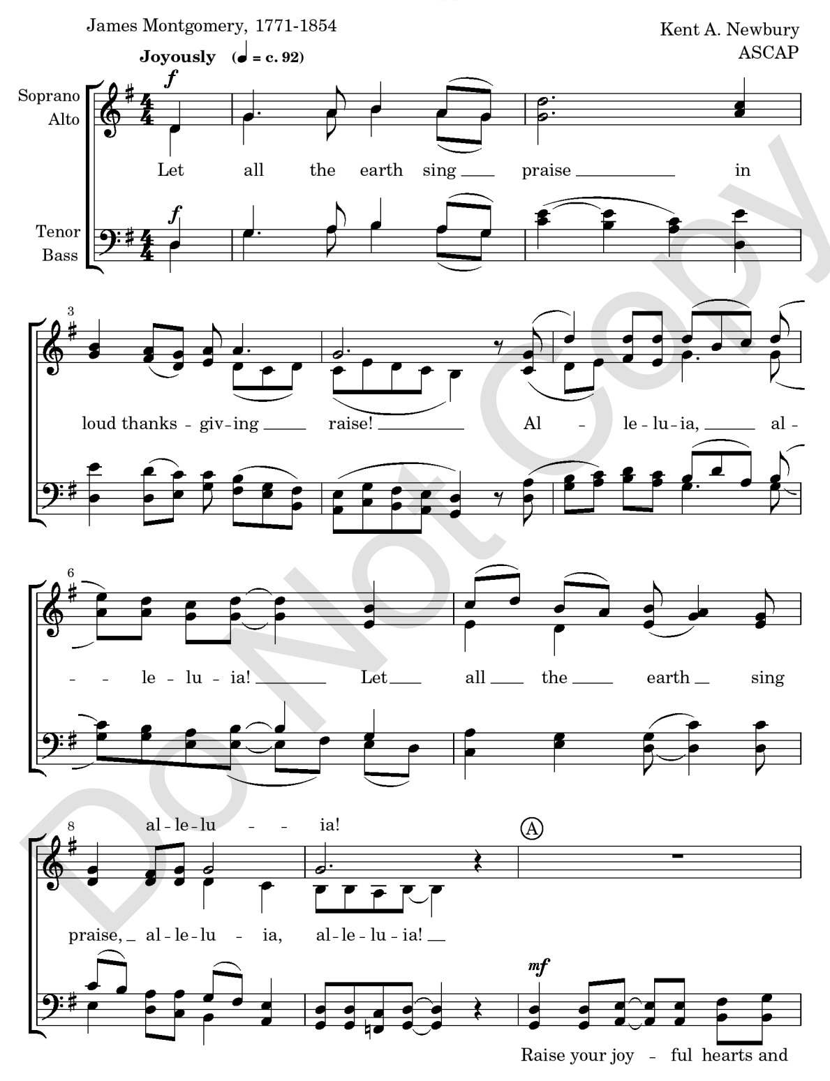
Copyright © 2011 by Paraclete Press, Orleans, MA 02653 All rights reserved.