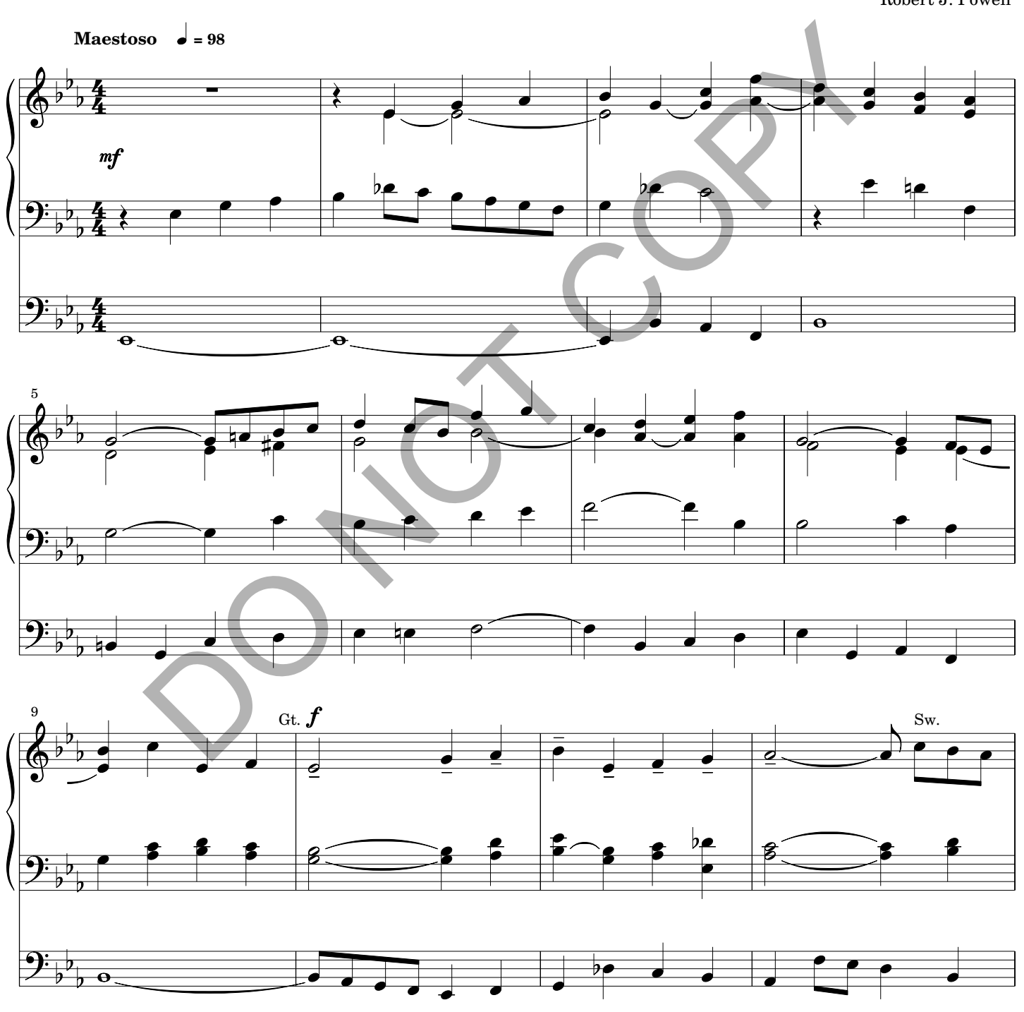
Copyright © 2015 by Paraclete Press, Orleans, MA 02653 All rights reserved.