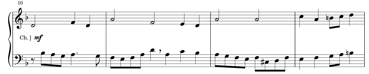
Copyright © 2015 Paraclete Press, Orleans, MA 02653 All rights reserved.

Sw. Viola 8', Flutes 8', 4', Principal 2' Ch. Flute 8', Principal 4', Sw. to Ch. 8'